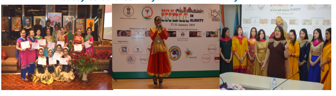
ITEC Day celebrations in Almaty