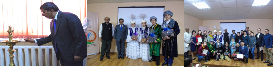
70<sup>th</sup> Republic Day Celebrations in Astana